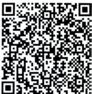
Synod-Presbyterian Church in Singapore PayNow/Paylah QR Code