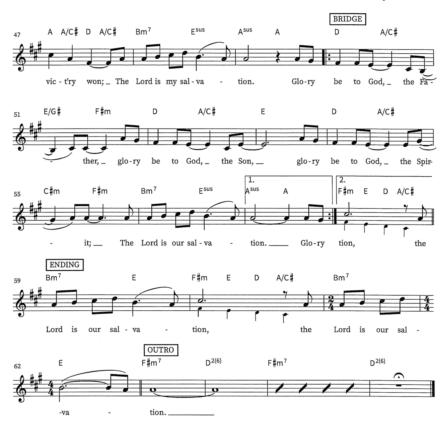
All music used by permission. CCLI #346426.