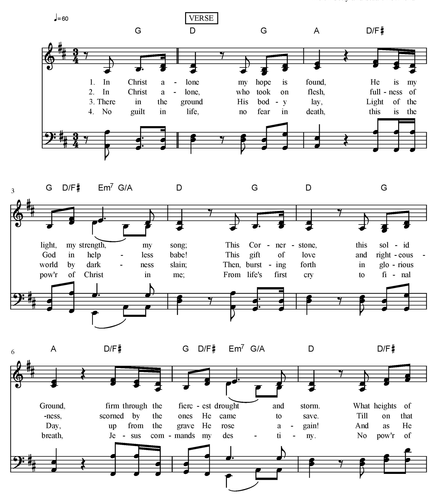
Words and Music by Keith Getty and Stuart Townend