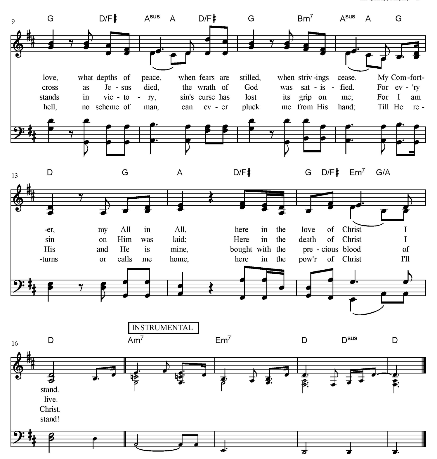
All music used by permission. CCLI #346426.